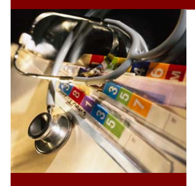
l → A Few AHCAE Faculty-s